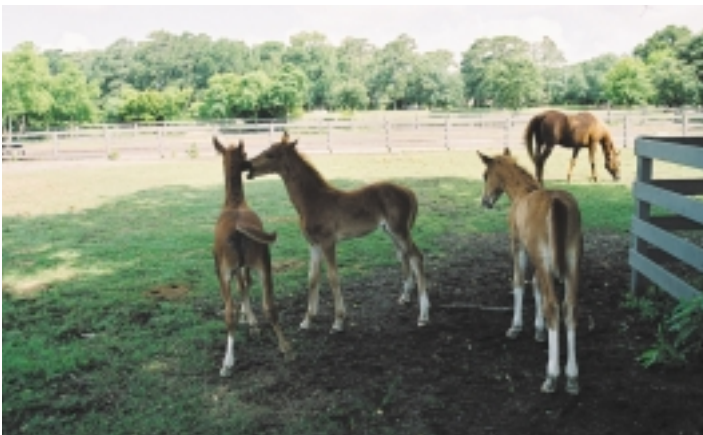
Foals at one of the stables.