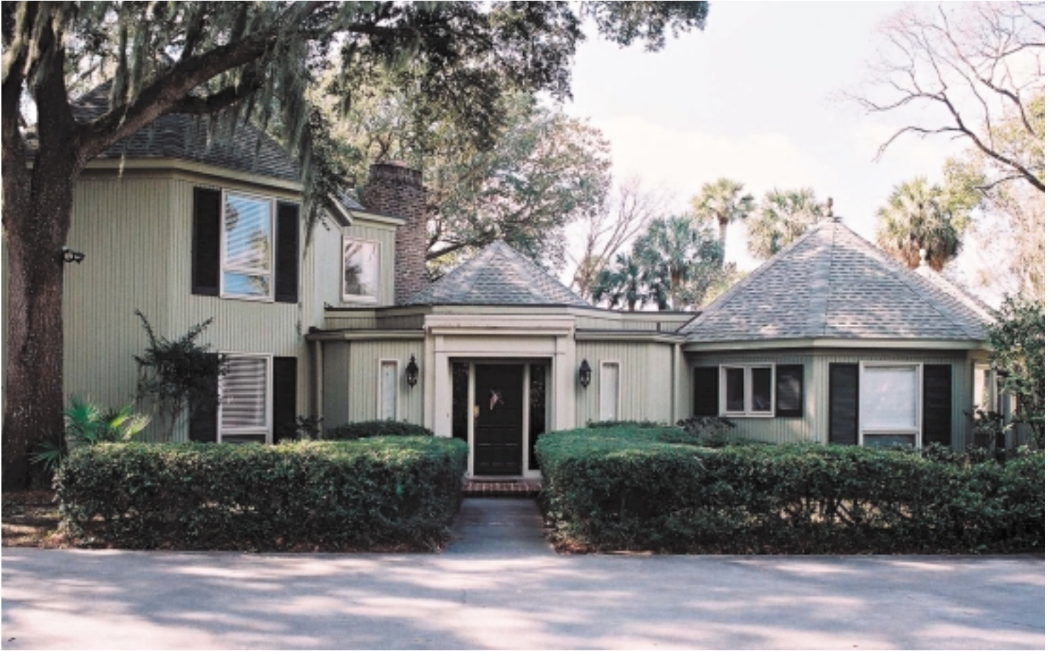
The main house.

SEA PINES, HILTON HEAD ISLAND - SOUTH CAROLINA - U.S.A.