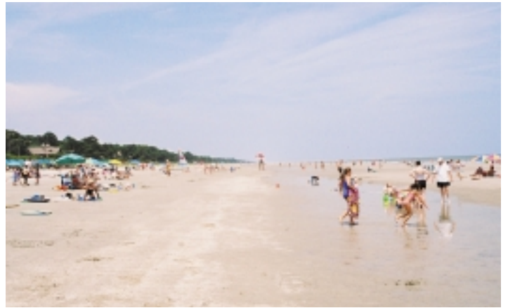
One of the beaches