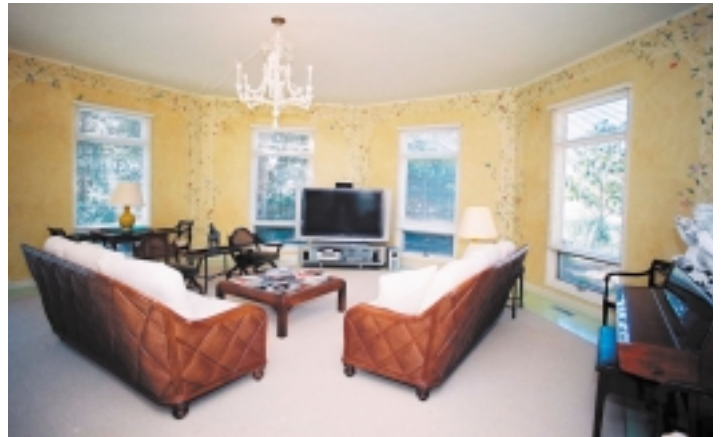
Family fun room.