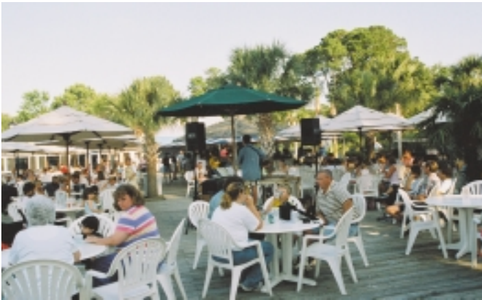
One of the many fine and varied restaurants.