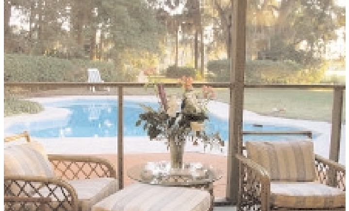
Porch overlooking the pool.