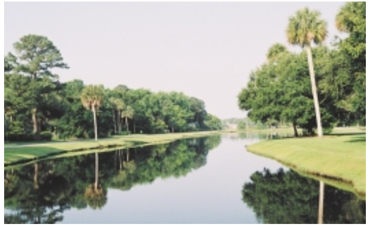
The Lagoon in front of the house.