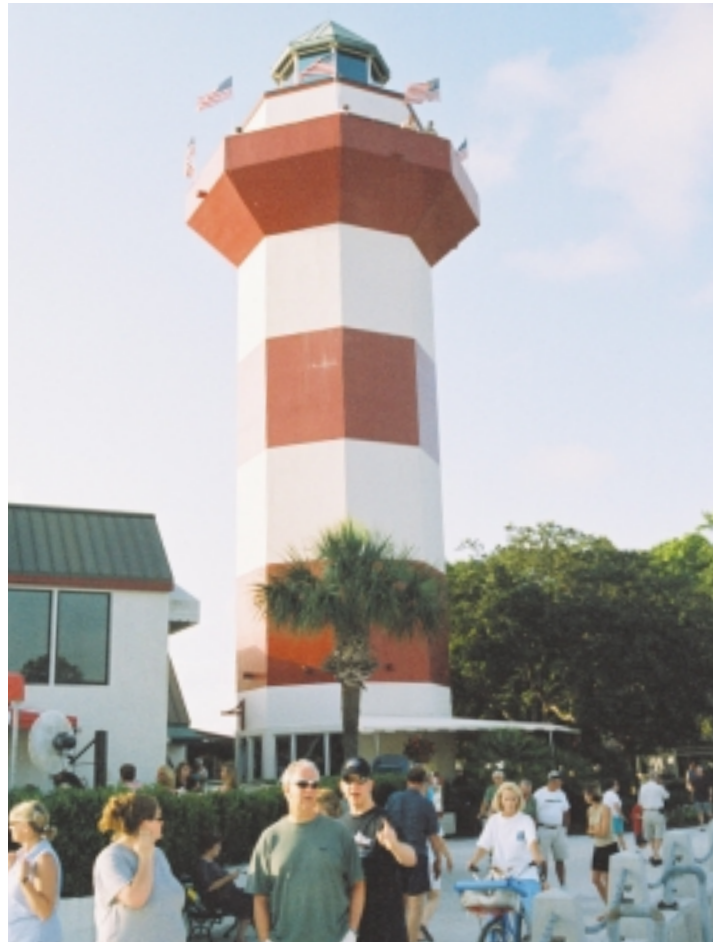
The famous lighthouse.