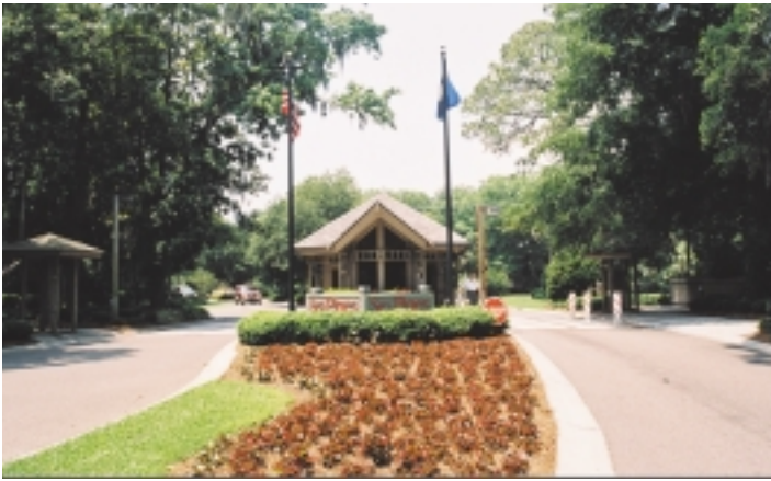
Entrance to the Sea Pines resort.