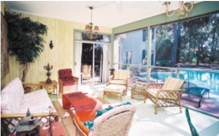
The porch looking towards the pool.