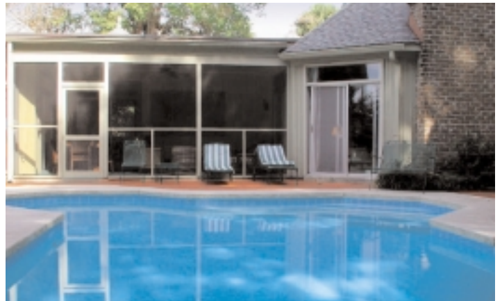
Pool and view of back porch.