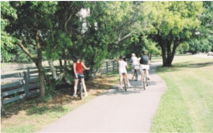
Cycling around Sea Pines.